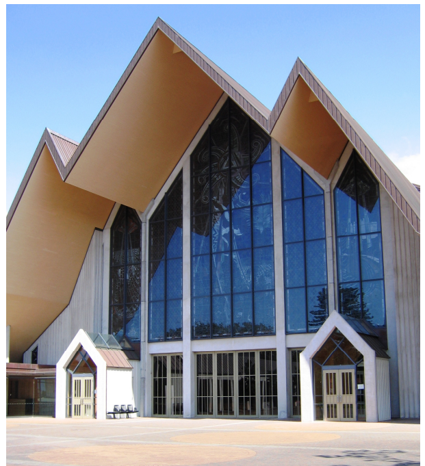
Holy Trinity Cathedral

Overall, my visit to Auckland was a highly enriching and educational experience. I was very happy to see that my performances of the voluntaries on Sunday the 26th were rather well received by the congregation of Holy Trinity, who were all extremely lovely! I've met a lot of wonderful people during my brief stay in Auckland, and