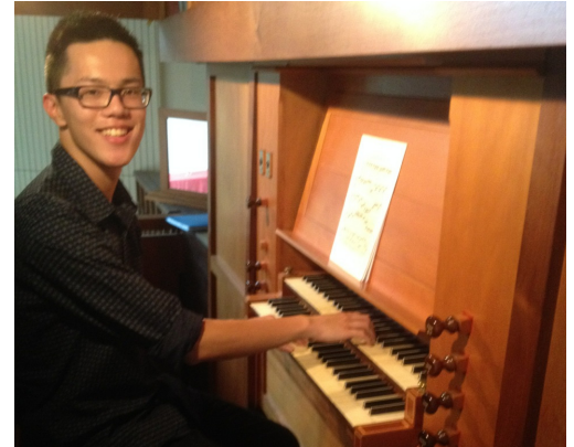
The organ of the MacLaurin Chapel