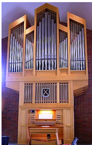
St Paul's Collegiate, Hamilton