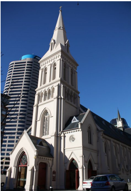
St Patrick's Cathedral

Over the next few days, I visited a few more organs around Auckland, such as those in St Patrick's Cathedral, St Matthew-in-the-City, MacLaurin Chapel at Auckland University, and Auckland Town Hall. Each organ left an entirely different impression upon me, as they were all highly different from the others, and each had their own particular characteristics. My favourite though would definitely have to be the Town Hall organ - Klais truly has magnificently restored this organ with its proper grandeur!