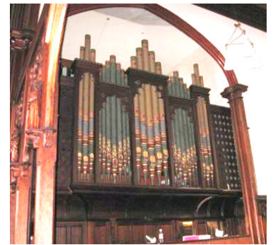
The organ of St Peter on Willis