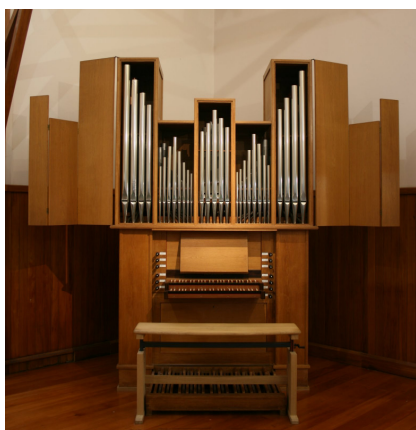
The organ of St Paul's Lutheran Church