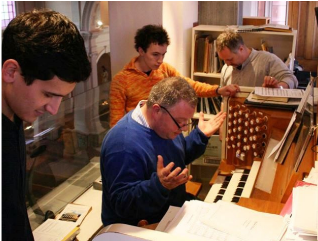
Improvising in the Basilica of the Sacred Heart

The Academy ended after the Sunday Eucharist services at Wellington Cathedral of St Paul and St Peter's on Willis, where the students were involved in providing service accompaniment.