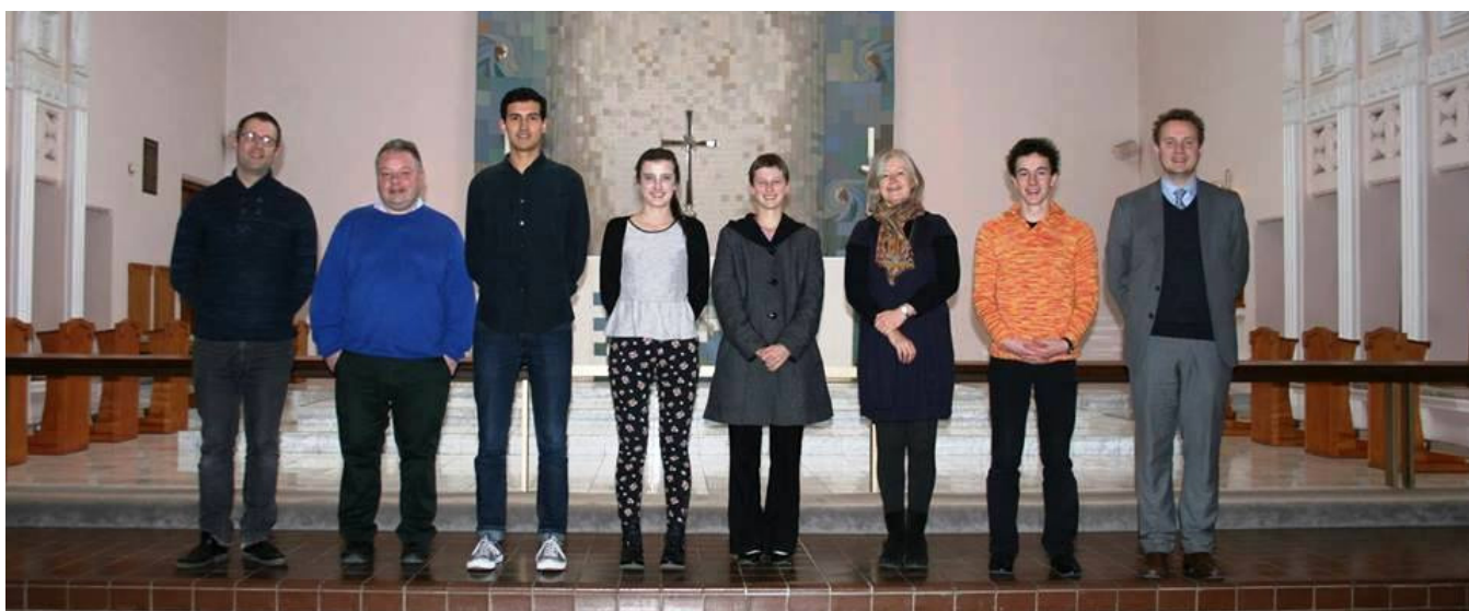
Participants and tutors of the 2014 Academy