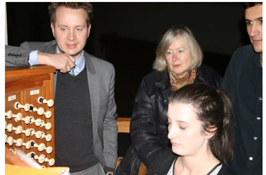
At the Cathedral Organ

"...The course was superb, and I had a great time - it was just what I needed, and a