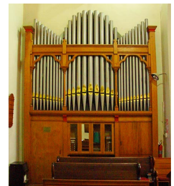
The organ of All Saints' Church, Dunedin

The 2016 Academy for the Australian and New Zealand College of Organists will be held in the city of Dunedin, between Thursday, 21<sup>st</sup> January and Sunday, 24<sup>th</sup> January 2016. The Academy, which will feature interactive classes, talks and concerts, will be a chance of organists, particularly young organists, to develop a wide range of practical skills, to develop their critical understanding and appreciation for a wide range of organ music, and to interact with peers and tutors alike. The 2016 Academy will be tutored by five highly-experienced teachers, each of whom bring an